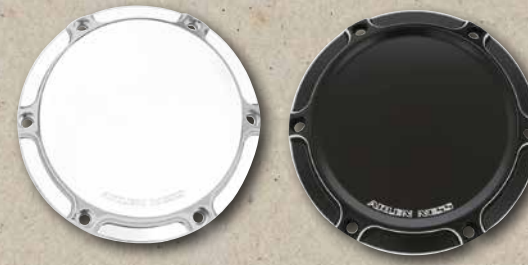
CATALOG "EDITION 46" PAGE 12.28