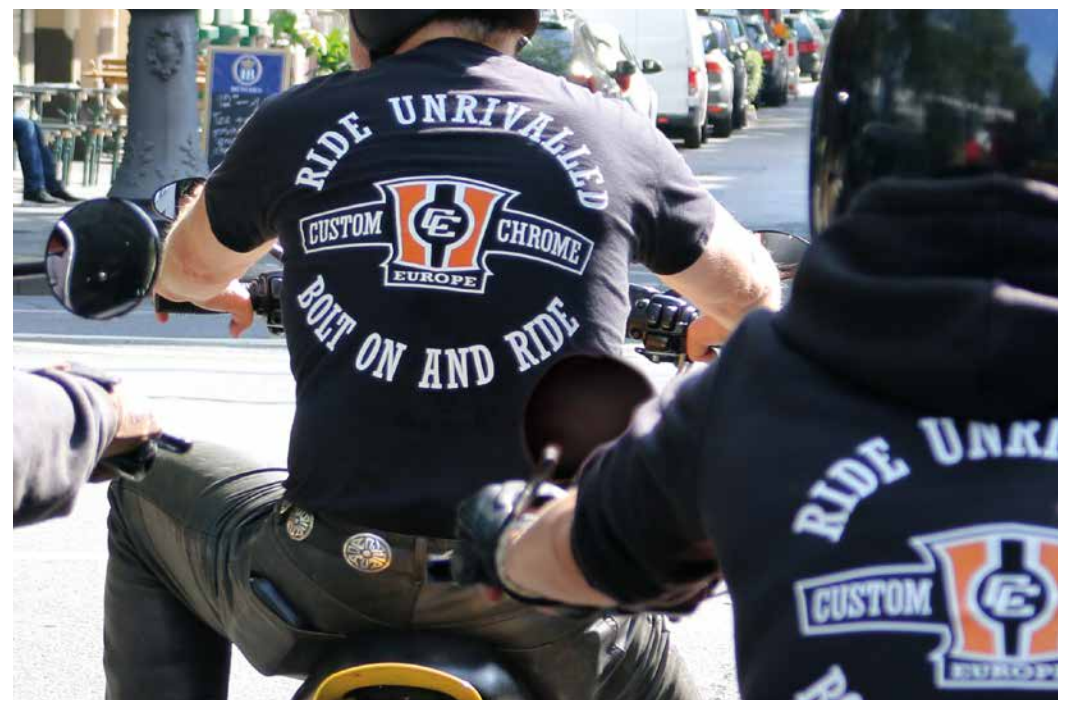
for more details check www.custom-chrome-europe.com